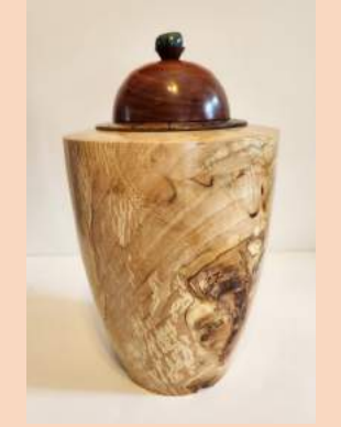
Maple Walnut Macacauba Aventurine—12" x 6"