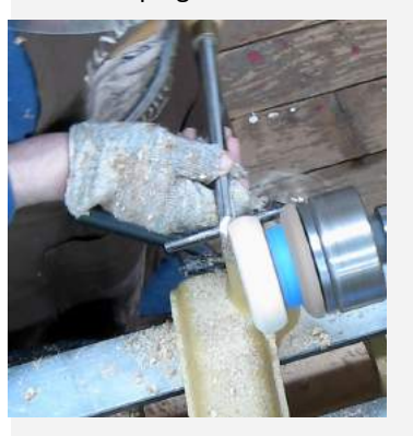
Next he repositioned the tool rest so that it faced the blank. The blank was positioned in the chuck with the rear part to be cut about half-