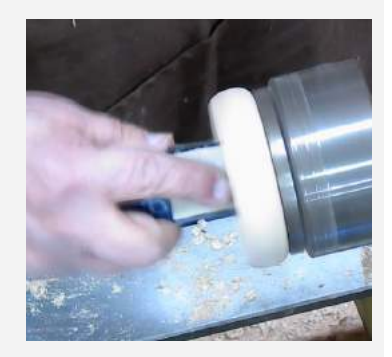
Finish can be friction polish, mineral oil, lacquer or almost anything. Buffing the final piece will make it smooth and shiny.