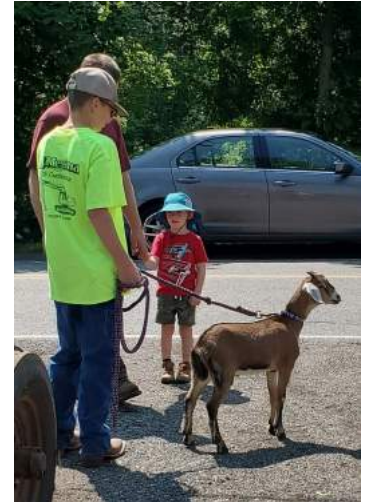
There was plenty of kidding around!

4, was rather wet. Because of this, a number of the original vendors could not make it to River Walk so this could have had an impact on attendance.