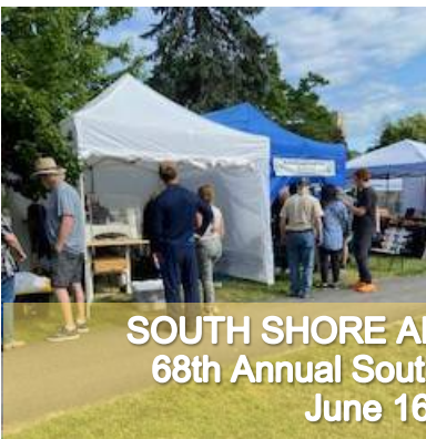
SOUTH SHORE ARTS FESTIVAL - 2023 68th Annual South Shore Arts Festival June 16 - 18, 2023