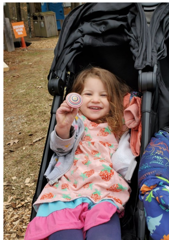
Free tops are priceless!