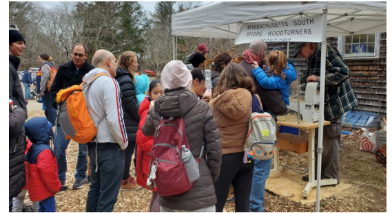
The lines were long all day, rain & shine