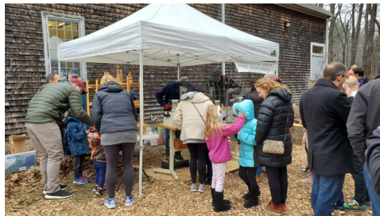
Setup outside! Lathes rested on boards & chips