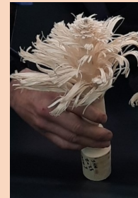
Mike's "flower show."

Using a rounded edge skew he aims to get the petals up to a foot in length. This requires wet wood.