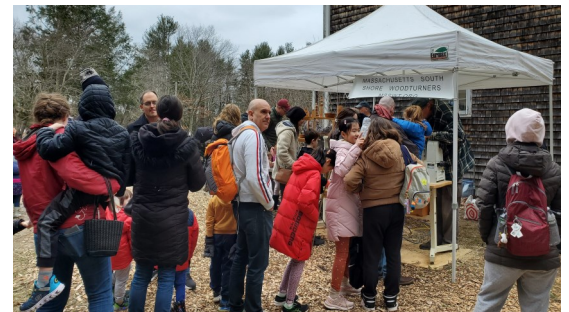
We gave out pre-turned tops to impatient kids