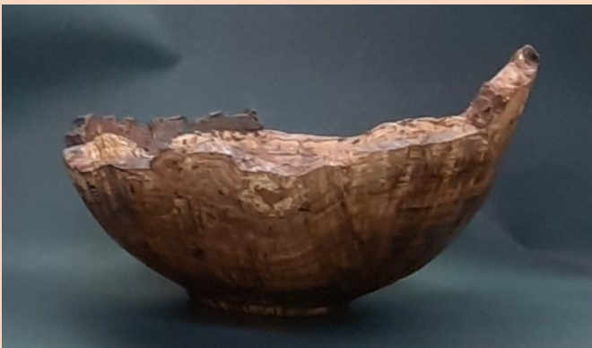
Large, natural edge red oak onion burl