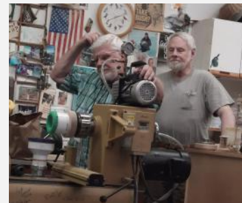
Pictured is the vacuum chuck with the motor attached and ready to be used.