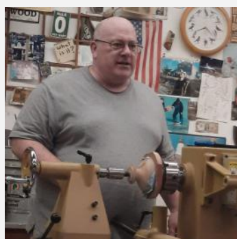
Here we see a homemade jam chuck in operation with a double set of paper towels to help secure the piece.