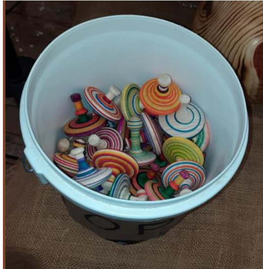
The top bucket. At the next meeting, could you please bring some tops to take to future shows?