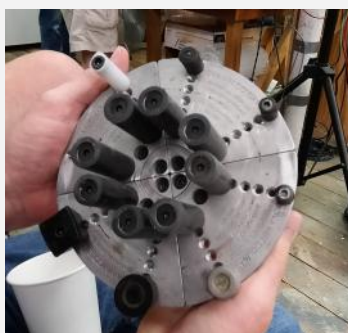
Closeup of the jumbo jaws expanded to illustrate the grabbing ability using the long padded stems inside as well as the smaller knobs outside.