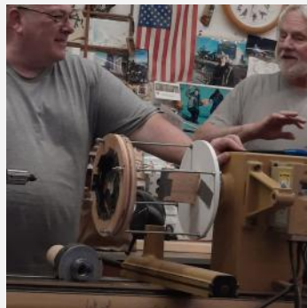
The sandwich chuck mounted on the lathe.

On display were several types of chucks including jumbo ("Cole") jaws, a vacuum chuck, a sandwich chuck and a jam chuck.