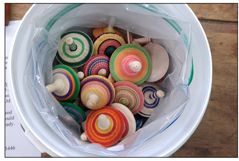
Pictured is a nice start to the top of the bucket for handouts at future shows, but we need more please.