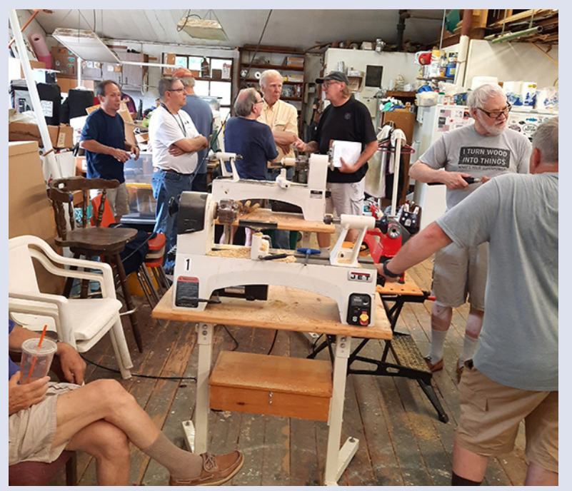
For a hot and humid Saturday morning, attendance at the Dust Bowl Hands On was pretty decent.