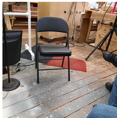
You're looking at the first of 15 new chairs Billy is purchasing for members for upcoming meetings to replace worn out older ones who have been known to collapse unex- pectedly. They are quite comfortable and are at a reasonable cost.