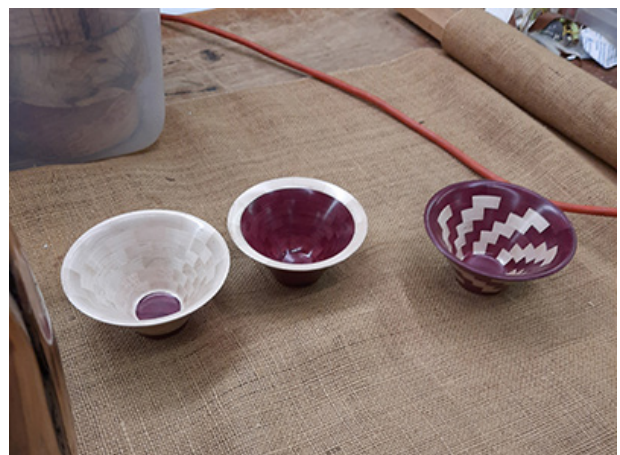
You're looking at three of Mike's bowls. They are segmented and have maple as well as purpleheart.