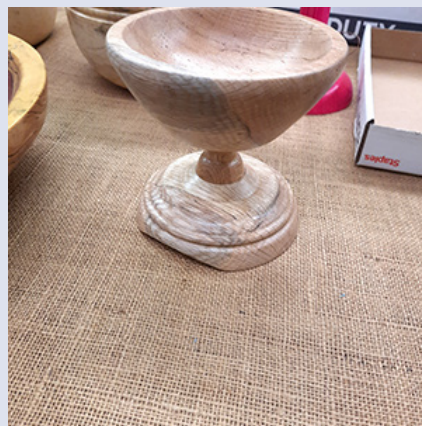
Here is a closeup of Bill’s goblet